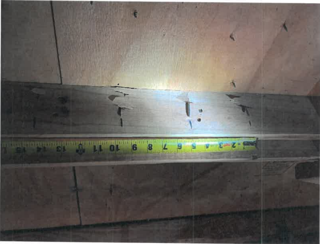
Figure 2 – Plywood Sheathing Nail Spacing (Typical)