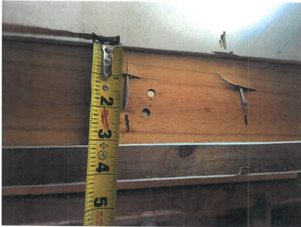
Figure 3 – Sheathing Fastener Size 8d Confirmed (Typical)